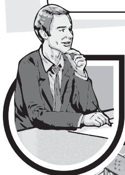
Youth Offending Team representative